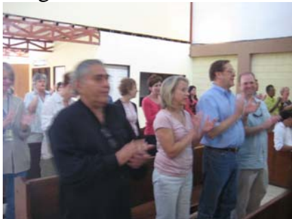
Team worships at Iglesia Evangelica Metodista de Costa Rica Emanuel in the barrio Guadalupe.